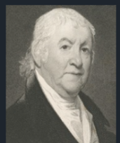
American Patriot Paul Revere

1735 Paul Revere , American silversmith and patriot who alerted the colonial militia to the approach of British forces before the battles of Lexington and Concord, born in Boston, Massachusetts (d. 1818)