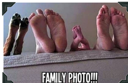
Grampa and me

Here are a couple of alternatives I found that might spice up that family history a bit.